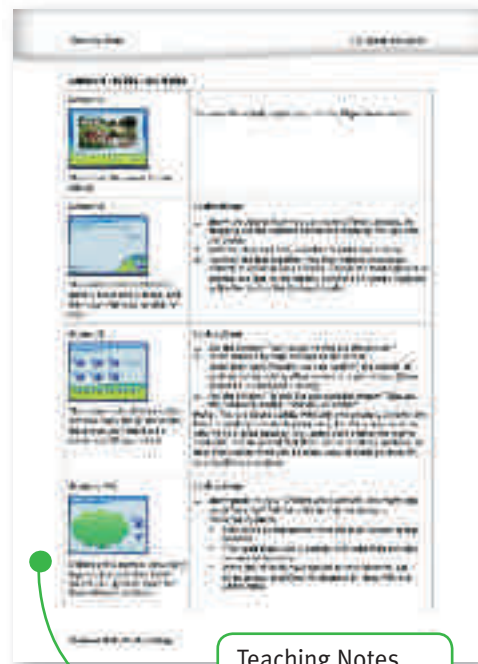
Teaching Notes guide you through the investigation, screen by screen

Engaging screens that are easy to demonstrate and fun for pupils to interact with