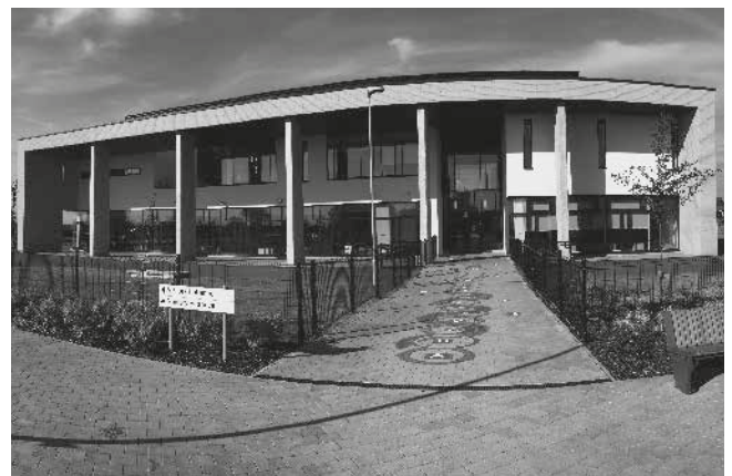
Orchard Primary School

Head Teacher, Jill Woodward brought Rapid to Orchard when it opened in 2016 having used it in her last two schools where she experienced what a powerful tool it can be for supporting struggling learners. The school has invested in all of the Rapid materials, including the online Rapid Reading collection.